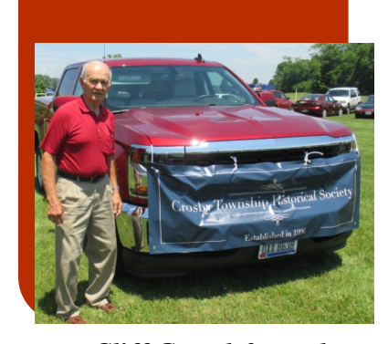
Cliff Guard & truck