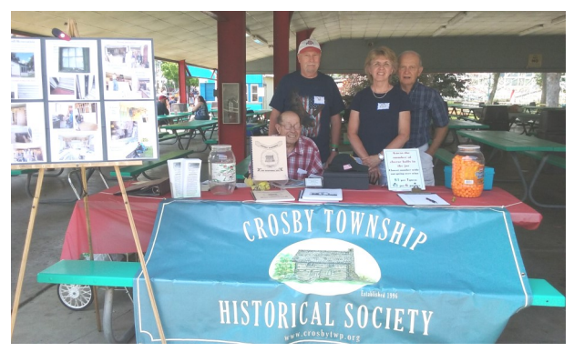
Society display & members