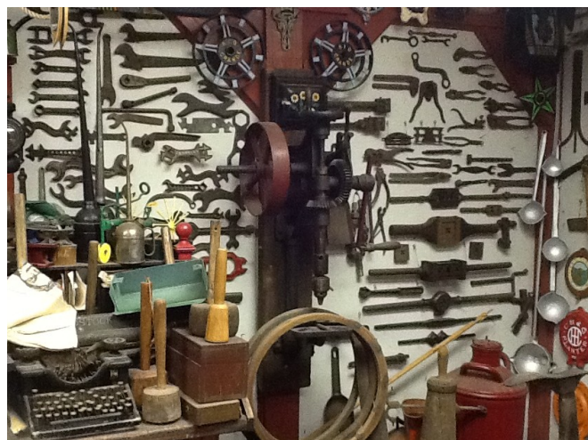
TOOLS —Paul Fritch set up a blacksmith shop display showcasing some of his vast collection of antique and unusual tools.