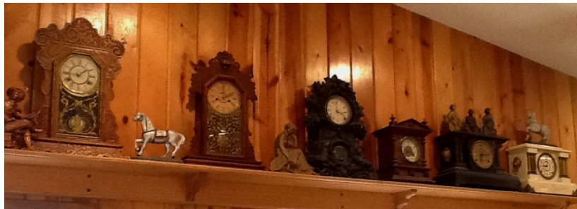
CLOCKS —a shelf holds a display of antique clocks.