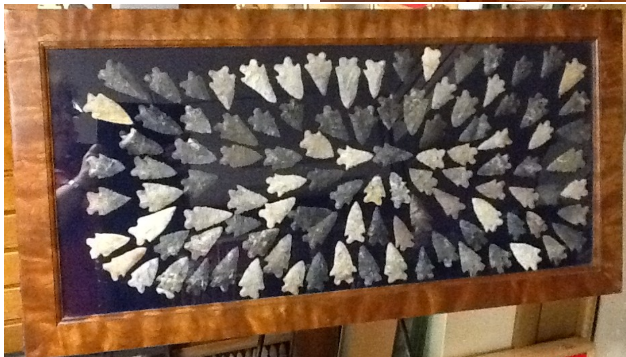
ARROW-HEADS —Pictured is a framed display of artistically arranged Indian arrowheads.